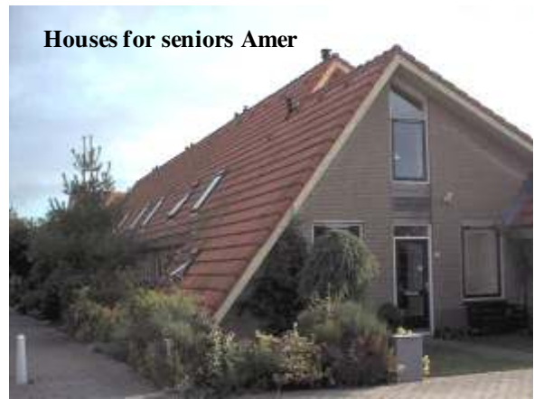
Houses for seniors Amer