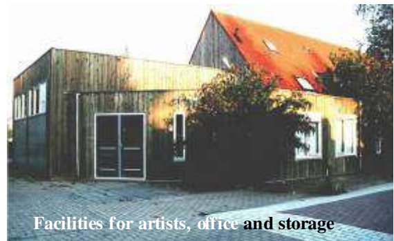
Facilities for artists, office and storage

Rivierenlaan 230-232 8226 LH Lelystad The Netherlands telefoon: 0320-218077 telefax: 0320-218639 email: woningbouw@sidhadorp.nl internet: www.harmonischleven.nl visiting hours: monday, wednesday, friday 9.30-12.30 uur