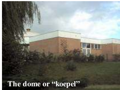
The dome or "koepel"

We invite you to come and stay in one of the guest apartments and have a taste of living in a Sidha village.