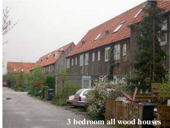
3 bedroom all wood houses