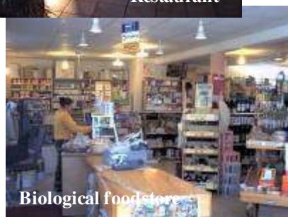
Biological food store