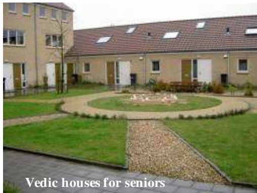
Vedic houses for seniors