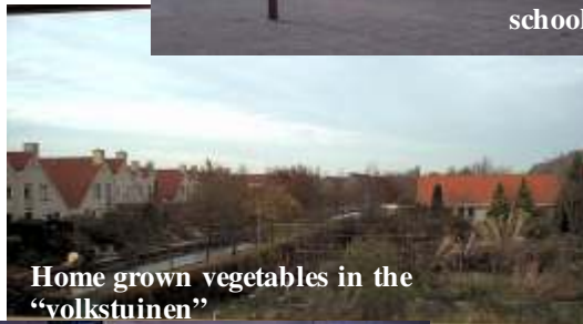
Home grown vegetables in the "volkstuinten"