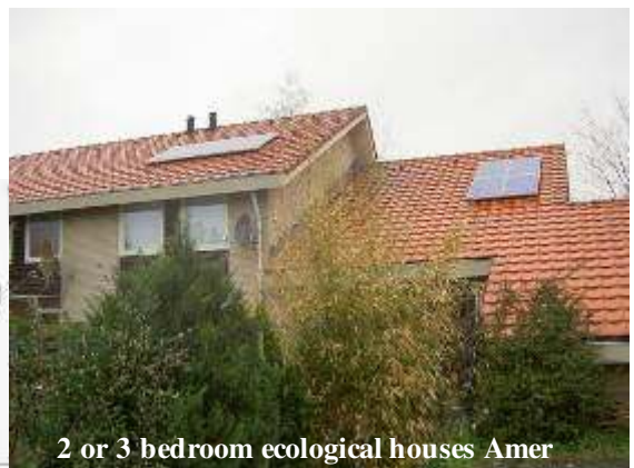
2 or 3 bedroom ecological houses Amer